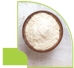
All-Purpose Flour (Maida)