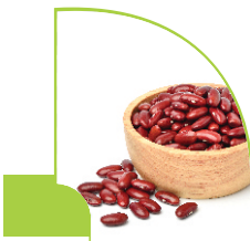
Red Kidney Beans (Rajma)