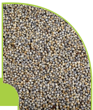
Pearl Millet (Bajra)