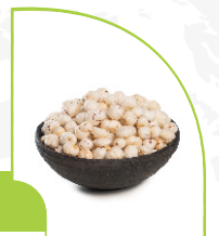
Fox Nuts (Makhana)