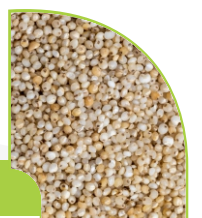
Little Millet (Kutki)