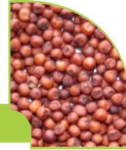
Finger Millet (Raagi)