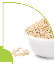
Split Black Gram (Urad dal)