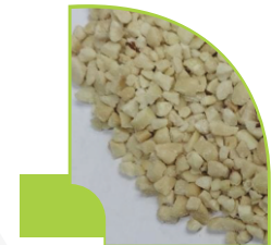
Roasted Peanut Granules