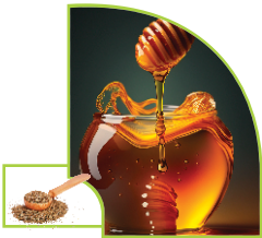
Carom Seeds (Ajwain) Honey