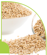
Sorghum Millet (Jowar)