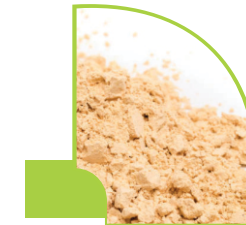
Natural Peanut Butter Powder