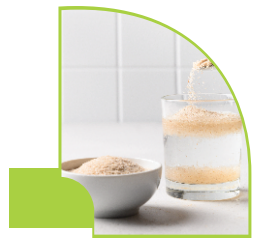
Psyllium Husk (Isabgol)