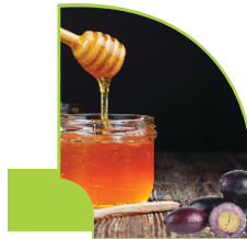
Java Plum (Jamun) Honey