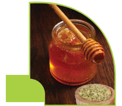
Fennel Seeds (Saunf) Honey