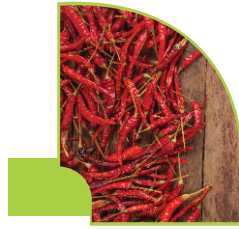
Dried Red Chilies