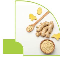
Dry Ginger Powder (sonth)