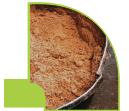
Chocolate Peanut Butter Powder