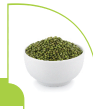
Green Gram Beans (Moong)