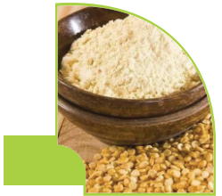
Chickpea Flour (Besan)