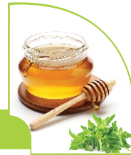
Holy Basil (Tulsi) Honey