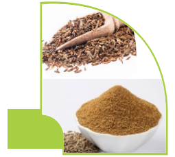
Cumin (jeera) Seeds & Powder