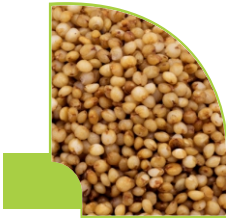
Kodo Millet (Kodra)